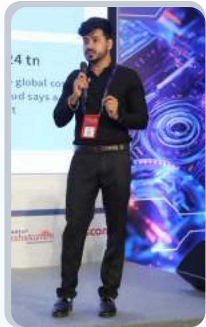
The pavilion showcased dynamic panel discussions, delivering invaluable insights from industry leaders under the expert moderation. Attendees gleaned essential knowledge on IP frameworks and strategic protection, crucial for navigating the multifaceted landscape of innovation across diverse sectors.