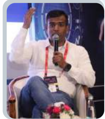
Looking ahead: The Opportunity in Fintech - The panel delved into the future prospects of fintech, highlighting the opportunities and potential for innovation in the evolving financial technology landscape.