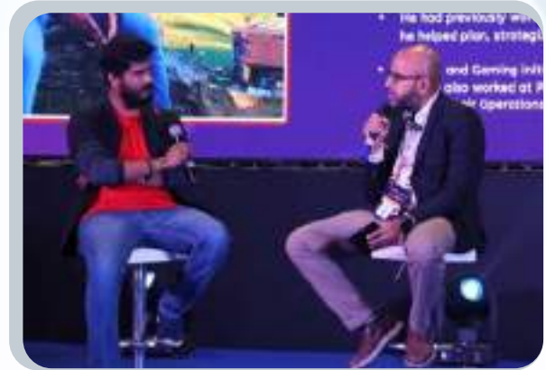
Level Up Your Future: A masterclass from industry experts on the Gaming and Esports Industry in India and what it takes to build a career out of your passion for gaming.