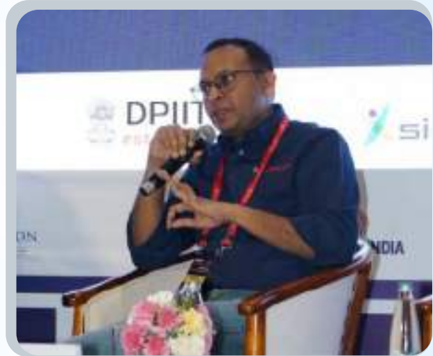
Post pandemic consumer trends and it's impact on internet economy: The session delved into post-pandemic consumer trends and their impact on the internet economy, highlighting shifts in online behavior and opportunities for businesses to adapt and thrive.