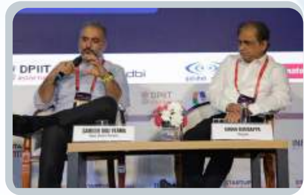
Whitespace in B2B and where can you build: The discussion explored whitespace opportunities in B2B, identifying areas where businesses can build and innovate.