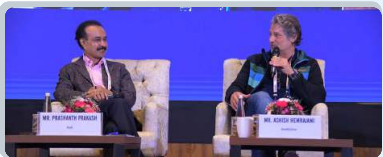
Navigating successes and failures: insights from building startups