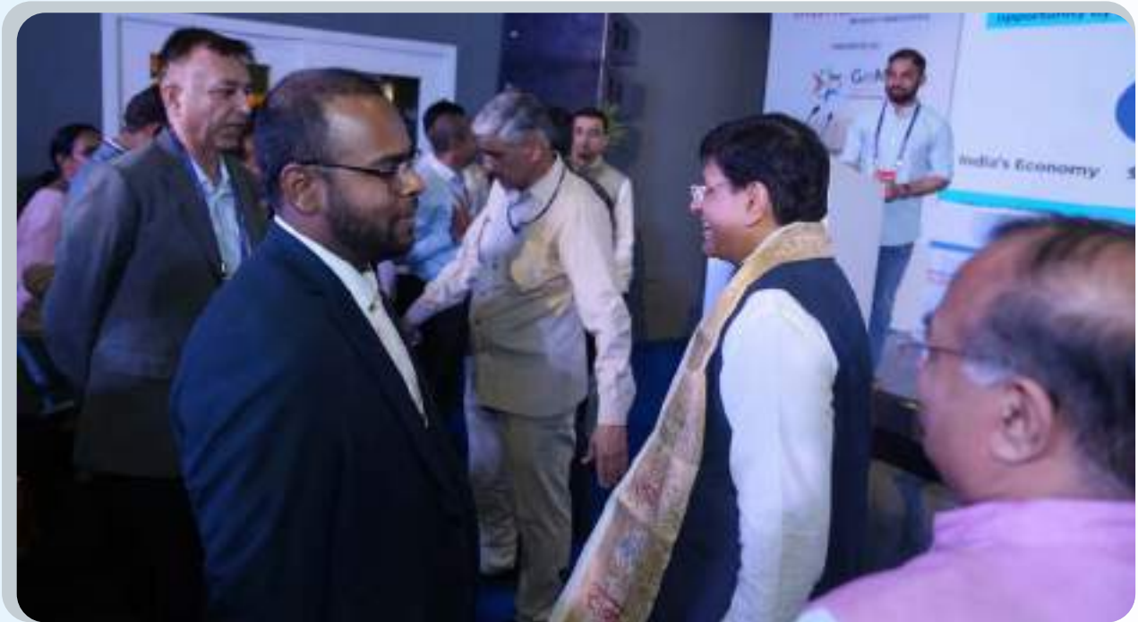
The winners of the 'AI for Public Good' contest, including eVerse. AI, B.A.E, and Bodhi, showcased AI-driven solutions tailored for India to address real problems.