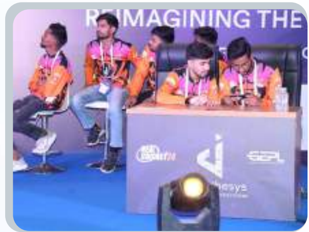
Tournament – Show match between Dubai Vipers & GEPL All-Stars