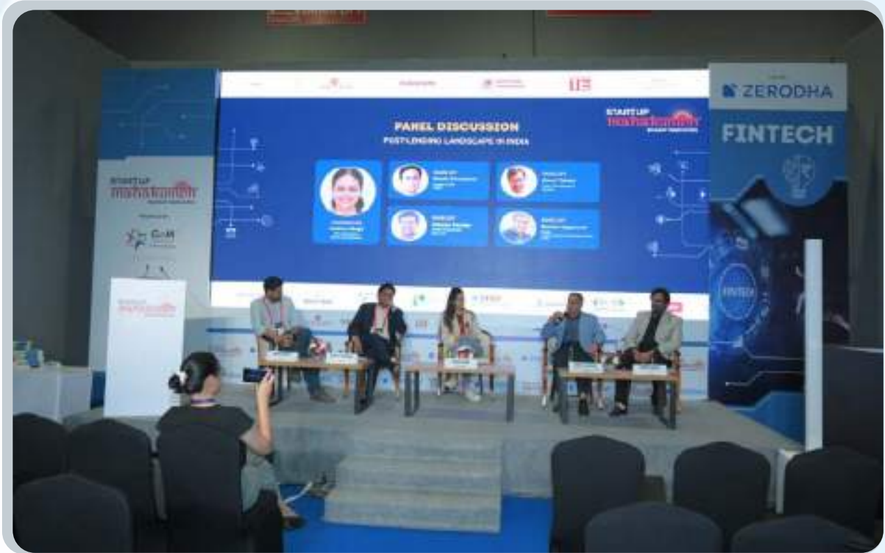
Post-Lending Landscape in India: The panel discussed the evolving post-lending landscape in India, exploring new trends, challenges, and opportunities shaping the financial sector.