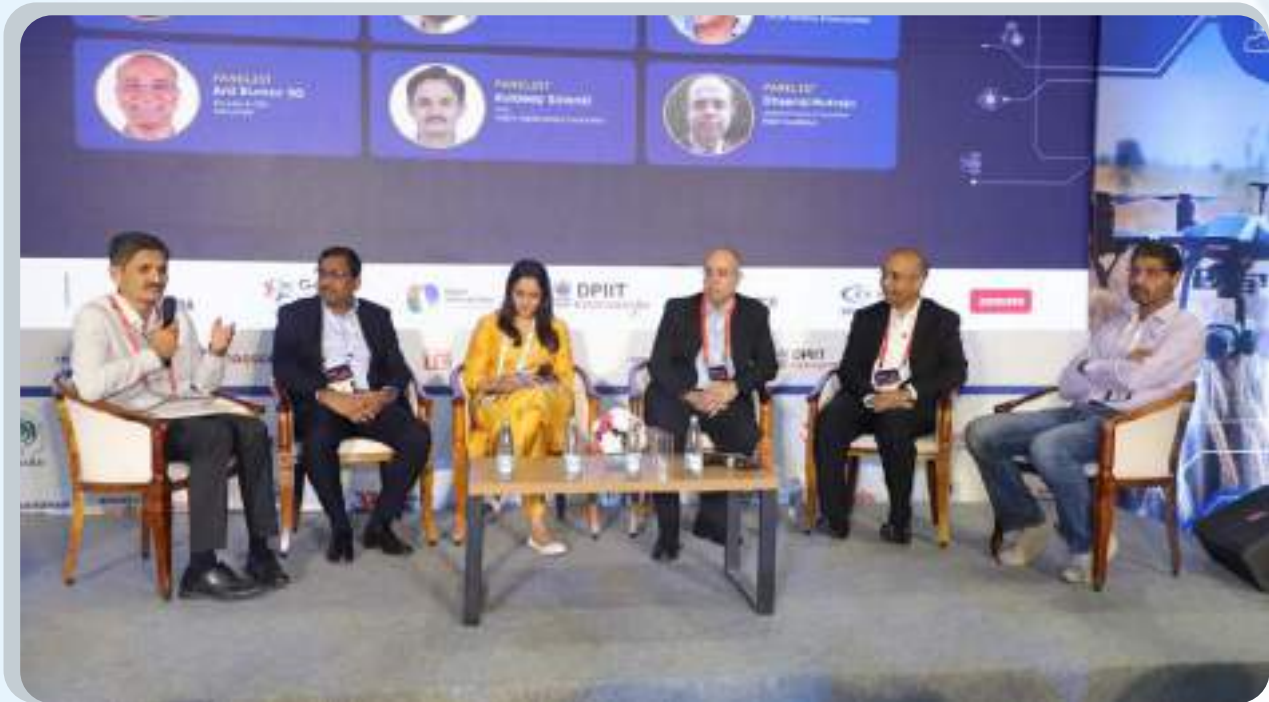
Cultivating synergies: An open house discussion on empowering agriculture through agri-techs and FPO collaborations.