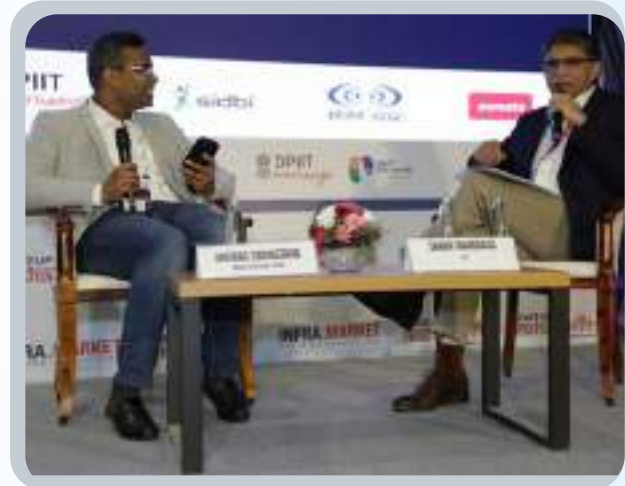
Evolution of brand in B2B: The discussion centered on the evolution of B2B brands, emphasizing understanding market dynamics and identifying niche opportunities to adapt and grow.