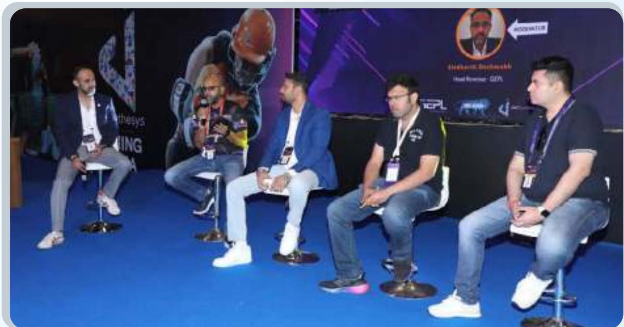
Impact of GEPL on bridging the gap between gaming, e-cricket, and entertainment

Overall, the pavilion served as a vibrant hub that united gaming enthusiasts, professionals, and investors in the exciting world of gaming and esports. By celebrating the meteoric rise of esports in India and highlighting the opportunities and potential within the industry, the pavilion inspired attendees and reinforced the importance of fostering talent, promoting innovation, and supporting the growth of gaming and esports in India.