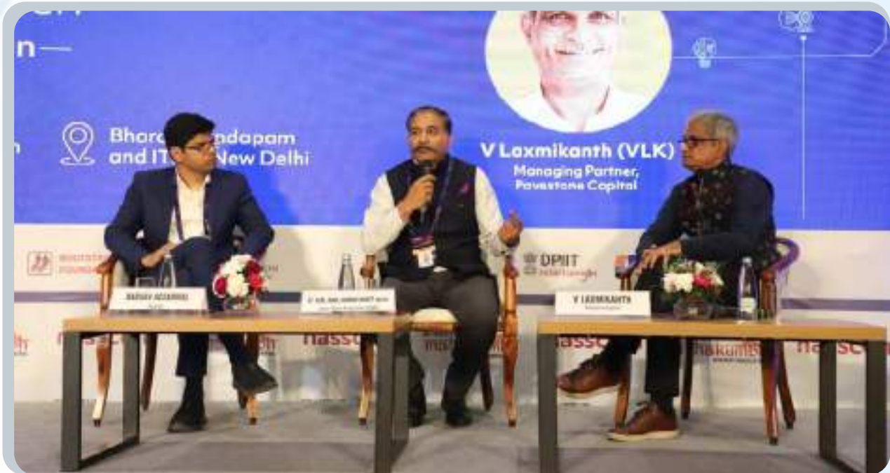
Rethinking Research Funding Models for DeepScience Advancements: The panel explored new approaches to research funding models for deep science advancements, emphasizing the need for innovative strategies to support and accelerate breakthrough discoveries.