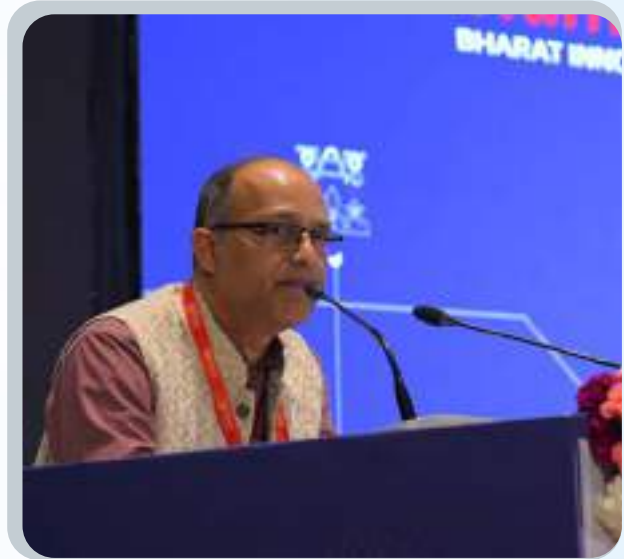
Empowering startups for a thriving tomorrow

K ris Gopalakrishnan, Chairman of Axilor Ventures, Co-founder of Infosys, President of ISF, highlighted advancements in the fintech sector, emphasizing the role of regulatory sandboxes and innovative approaches to regulate digital public infrastructure, ensuring equal opportunities for all.