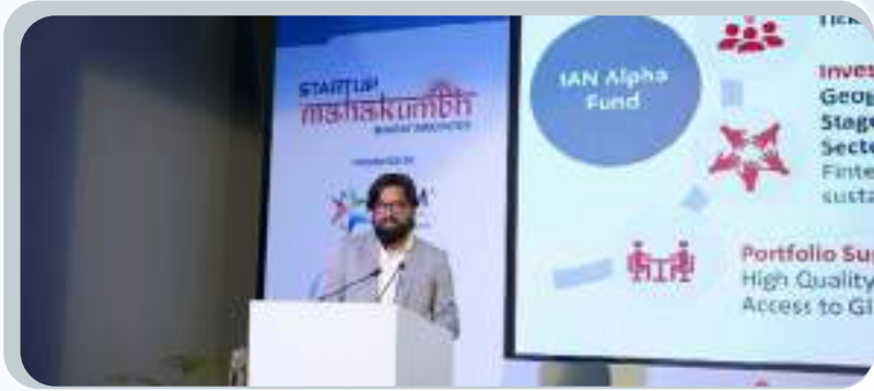
AI and SAAS for India: The session highlighted AI's transformative potential to revolutionize industries, showcasing India's unique position to lead in this technological revolution.