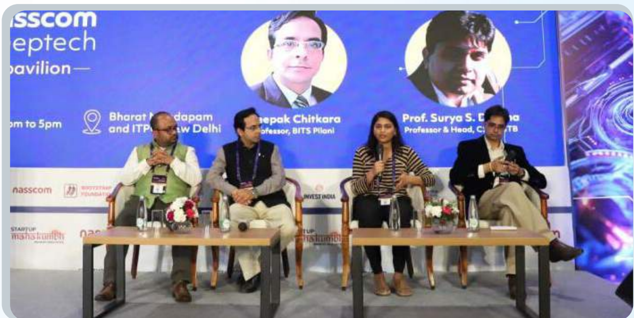
IP Protection & Technology Transfer: The panel discussed IP protection and technology transfer, highlighting strategies and best practices to safeguard intellectual property and facilitate successful technology transfer.