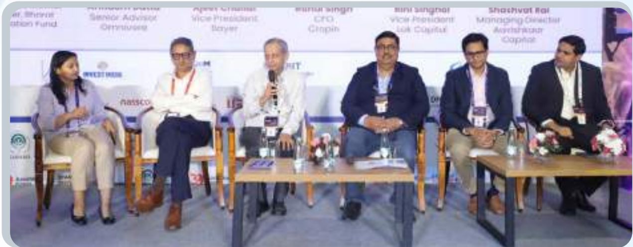
Investing in the future of agriculture: emerging trends and innovations in Agritech - The session was focused on the transformative role of agritech in driving innovation and sustainability in the agricultural sector.