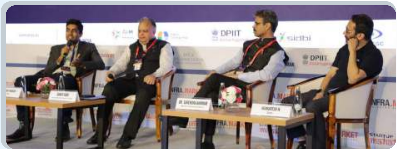
Innovations in logistics – the next decade: The discussion explored future innovations in logistics, highlighting effective working capital management and supply chain optimization for the next decade.