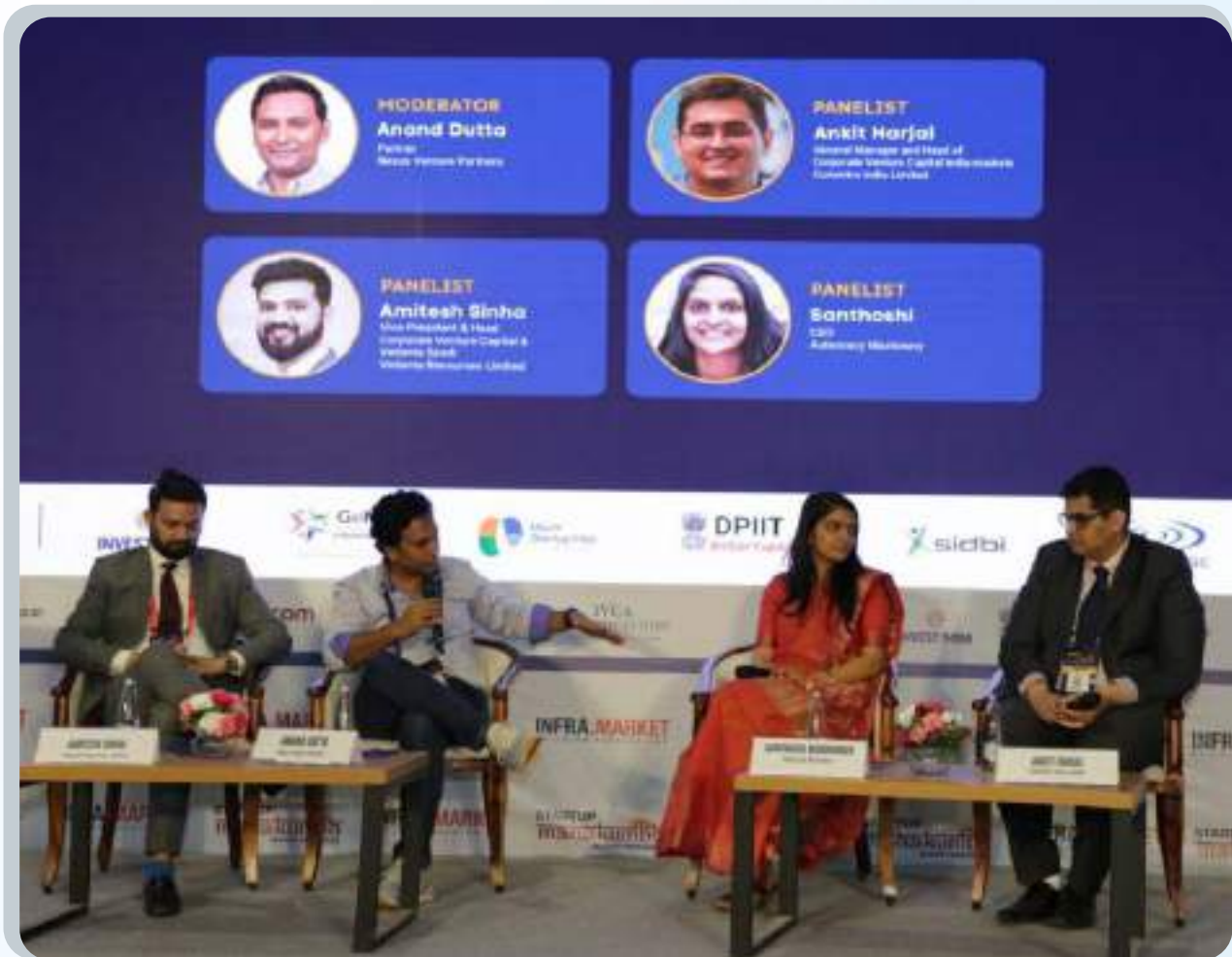
Future of Manufacturing: The session provided actionable advice and emphasized essential elements for thriving in India's dynamic and competitive business landscape.