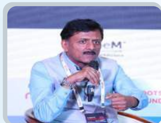
GEM for startups: The discussion highlighted GeM's support for startups through programs like Startup Runway, showcasing innovative solutions across various sectors.