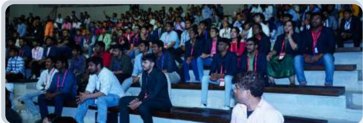
Live concert of Ricky Kej (3X Grammy Award Winner) on 19th March 2024