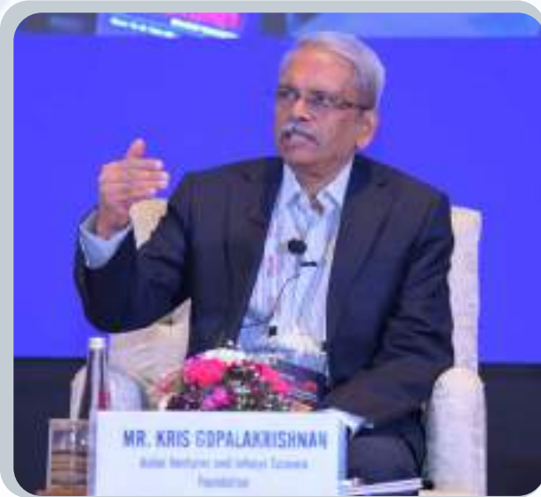
Role of regulatory sandboxes in fintech

K ris Gopalakrishnan, Chairman of Axilor Ventures, Co-founder of Infosys, President of ISF, highlighted advancements in the fintech sector, emphasizing the role of regulatory sandboxes and innovative approaches to regulate digital public infrastructure, ensuring equal opportunities for all.