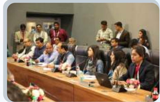
Angel Networks in Tier II & III towns-Access to capital for early-stage Incubators/ Startups