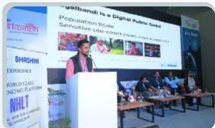
Bhashini Presentation and Hackathon: Bhashini's presentation and hackathon showcased their innovative AI adoption, reinforcing the pavilion's status as a global innovation hub.