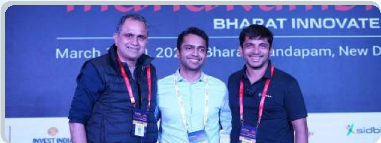
Blueprint for finding PMF in AI/ SAA: The session provided attendees with a structured approach to achieving Product-Market Fit in these industries.