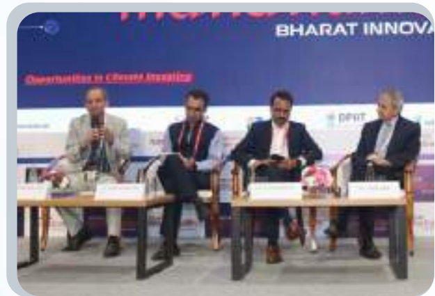
Opportunities in Climate Investing: The panel explored opportunities in climate investing, discussing the potential for sustainable investments to drive positive environmental impact and financial returns.