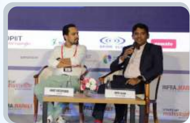
Effective management of your working capital: The discussion emphasized the importance of effective working capital management for sustaining business operations, optimizing liquidity, and supporting growth.