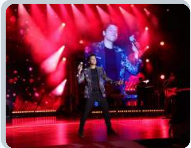
Live concert of Shaan on 18th March 2024