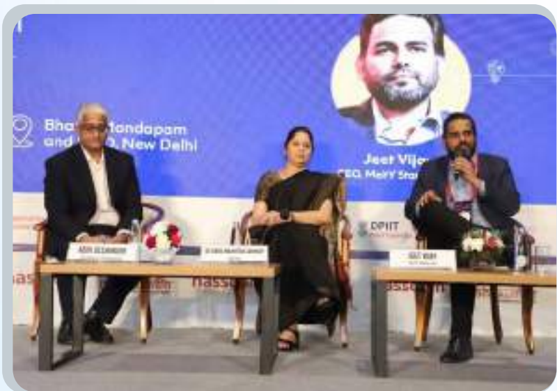
Commercialization for DeepTech Innovation: IP Framework: The panel discussed the commercialization of deeptech innovation, focusing on the importance of an effective Intellectual Property (IP) framework to support and protect innovations.