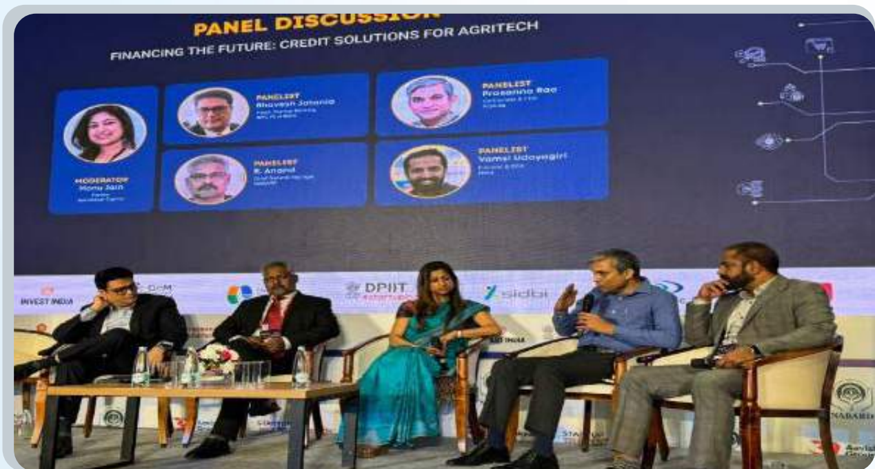
Financing the Future: Credit Solutions for Agritech - The panel discussion offered deep insights into tailored credit solutions for the agritech sector.